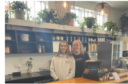
Two Sisters Baked & Co