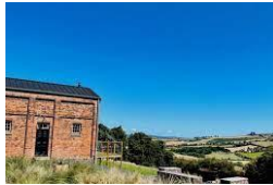
Harland Rise Chapel