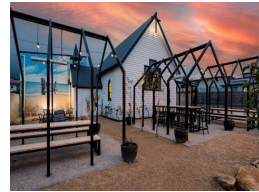
St Mark's Bridport