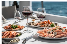
The York Cove Hotel George Town