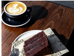
Bread & Butter Bakery George Street