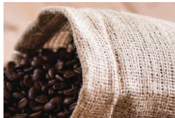
Hebe Reef Cafe George Town