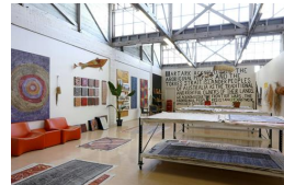
Art Ark Ethical Aboriginal Art